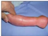
Burn wound before and after 21 days of AQ Recovery Serum treatment